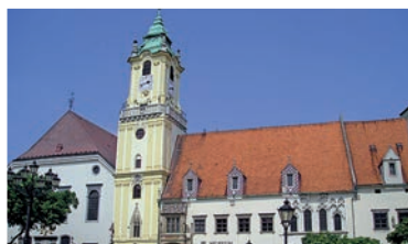
BRATISLAVA & DEVÍN CASTLE

Bratislava Bike Point, Viedenská cesta – the UFO restaurant parking spot.