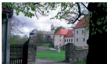
SMALL CARPATIAN WINE TOUR