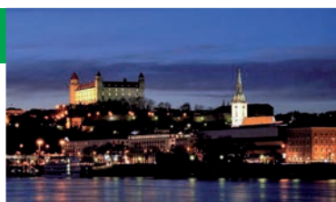
BRATISLAVA BY NIGHT