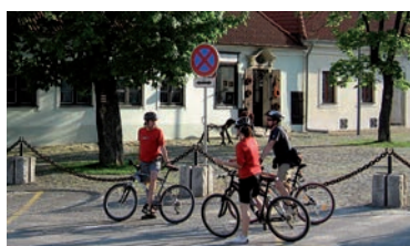
GUIDED BIKE TOURS